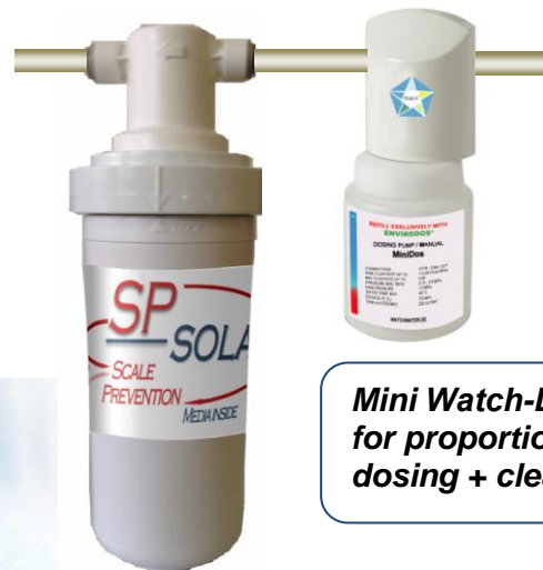
Mini Watch-Dos for proportional dosing + cleaning