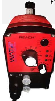
Shipping weight PV

Watch-Water® GmbH Fahrlachstraße 14 68165 Mannheim, Germany Tel. +49 621 87951-0 Fax +49 621 87951-99 info@watchwater.de